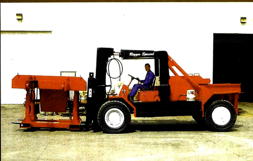
Optional telescoping rigging boom, solo matic tires